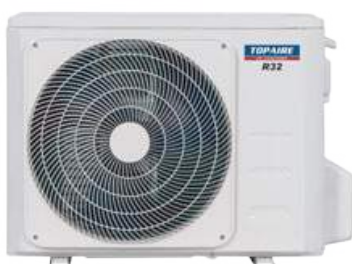
TAS 30AG3 TASV 30G3